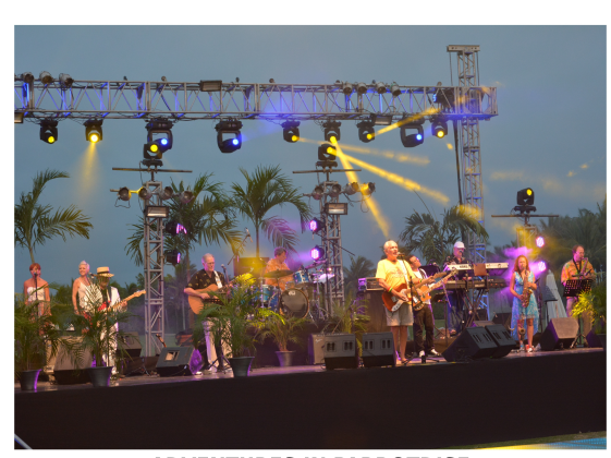
ADVENTURES IN PARROTDISE A Tribute to Jimmy Buffett