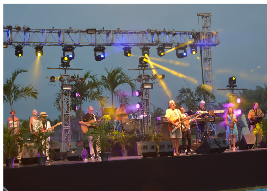
ADVENTURES IN PARROTDISE A Tribute to Jimmy Buffett